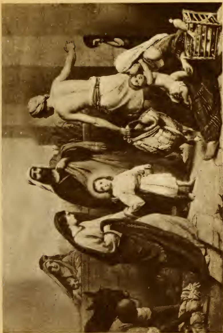
“When Herod was dead, He came and dwelt in the city called Nazareth.”